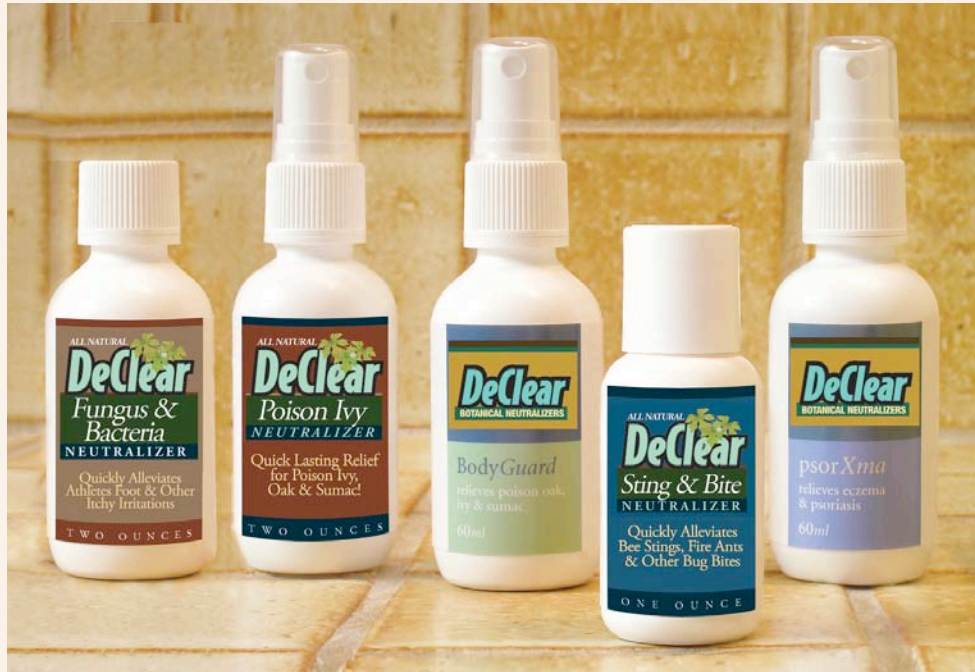
All Natural Botanicals that Neutralize Toxins